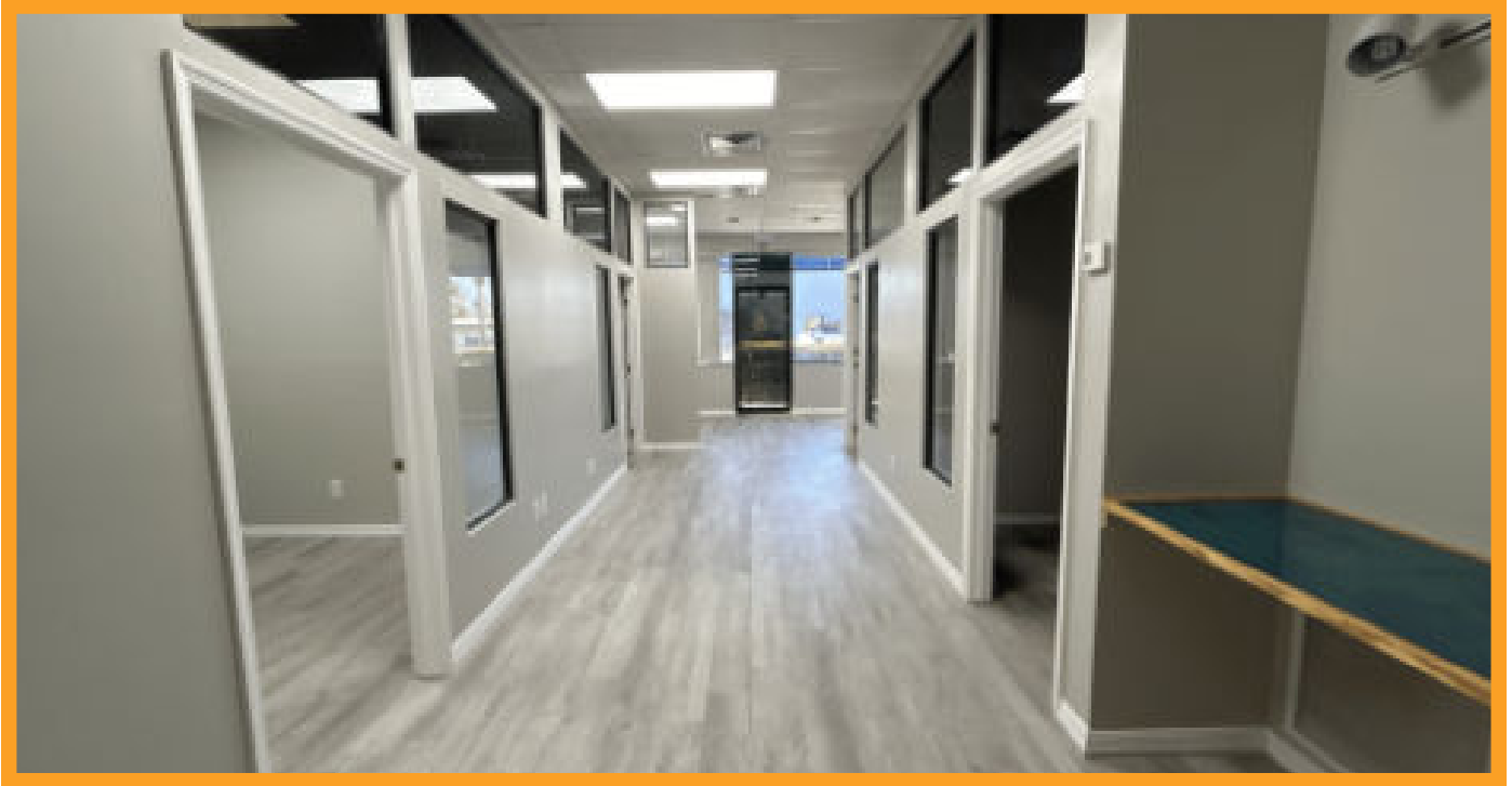
SECOND FLOOR SUITES 203, 204 & 205

503 N Orlando Ave., Cocoa Beach, FL 32931