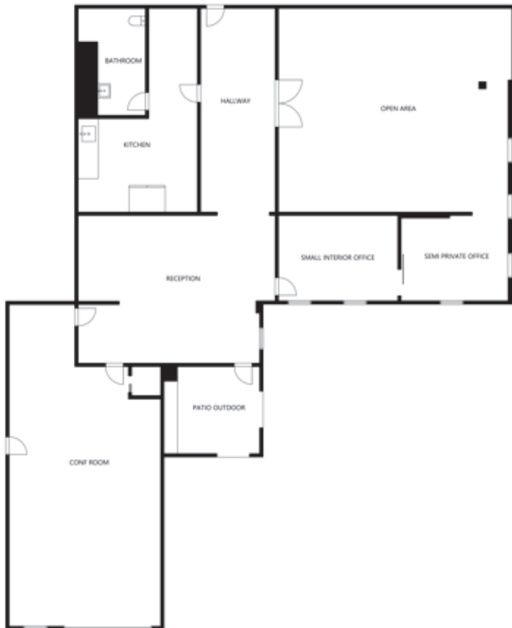
Suite Layout - 108

2425 Pineapple Ave., Melbourne, FL 32935