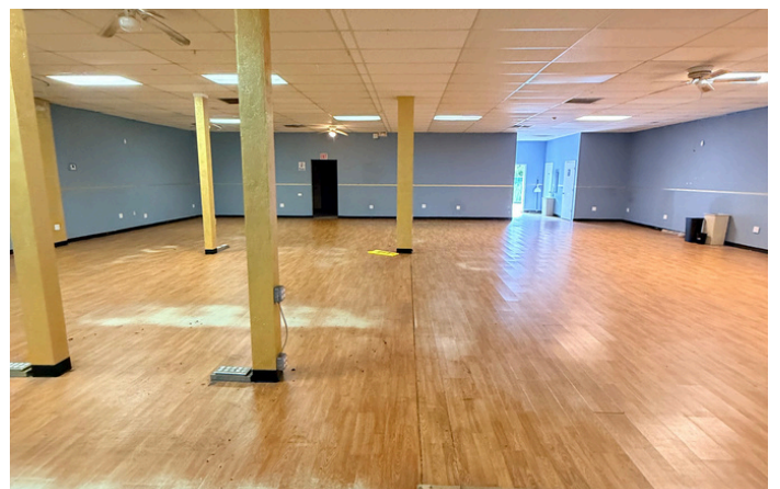
Large Open Collaborative Space