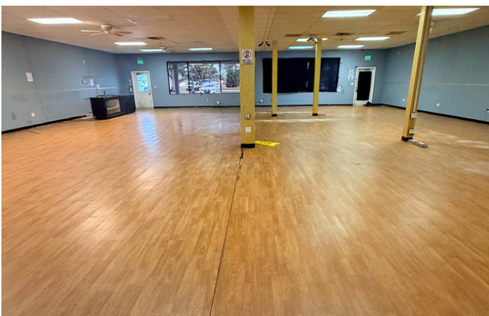
Open Workspace with Support Columns