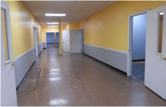
Hallway / Corridor Access