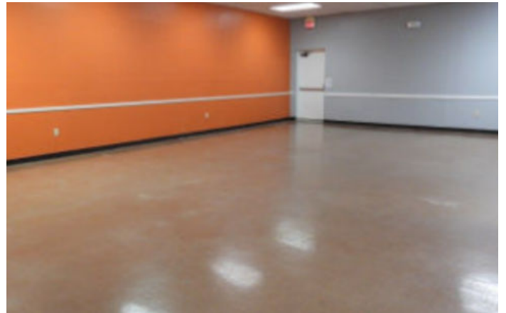
Large Open Room with Accent Wall