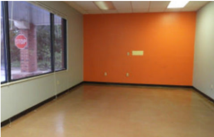
Office Space – Renovation Ready